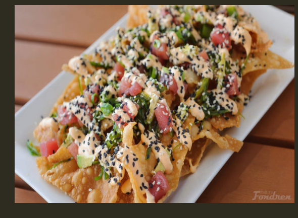
Table 100- a Casual- Euro American Bistro offering a unique experience with a piano bar, craft cocktails, and classic Southern Bistro fare served with a modern twist.

Barrelhouse- A uniquely Southern take on the modern Gastropub with an exceptional menu and wonderful cocktails